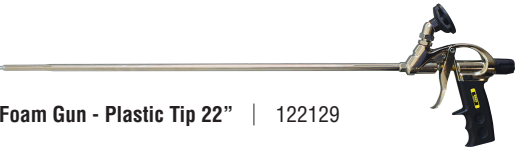
Foam Gun - Plastic Tip 22" | 122129