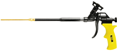
Foam Gun - Threaded Metal Tip | 144150